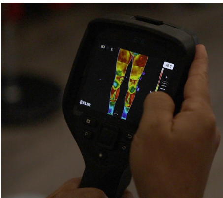
Thermal image of cyclist legs

As pioneers in thermal analysis for cycling applications, Bikefit Van Staeyen works in close collaboration with Thermal Focus, a Flir Partner and stockist of the largest selection of Flir infrared cameras in the Benelux (Belgium, Netherlands, Luxembourg) region.