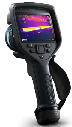
Flir E96 Thermal Imaging Camera

"We use a Flir infrared camera to study a heat map of a rider pedaling to optimize body position and bike set up," says Kevin. "By combining thermography